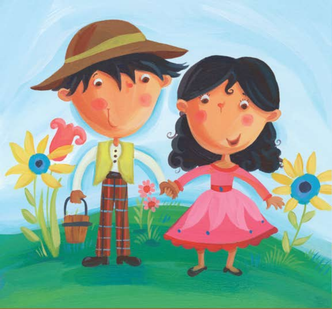
Jack and Jill