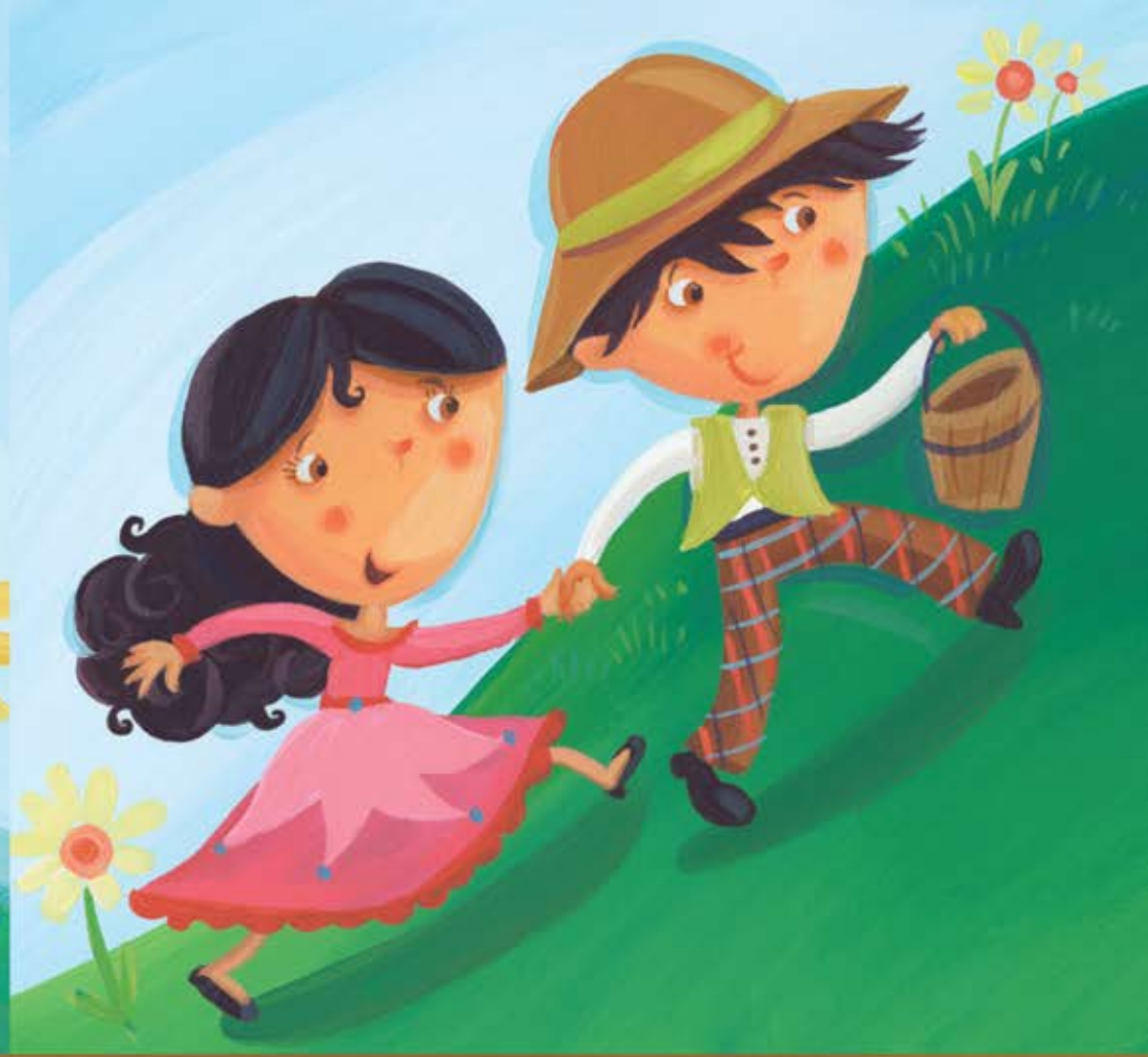
went up the hill