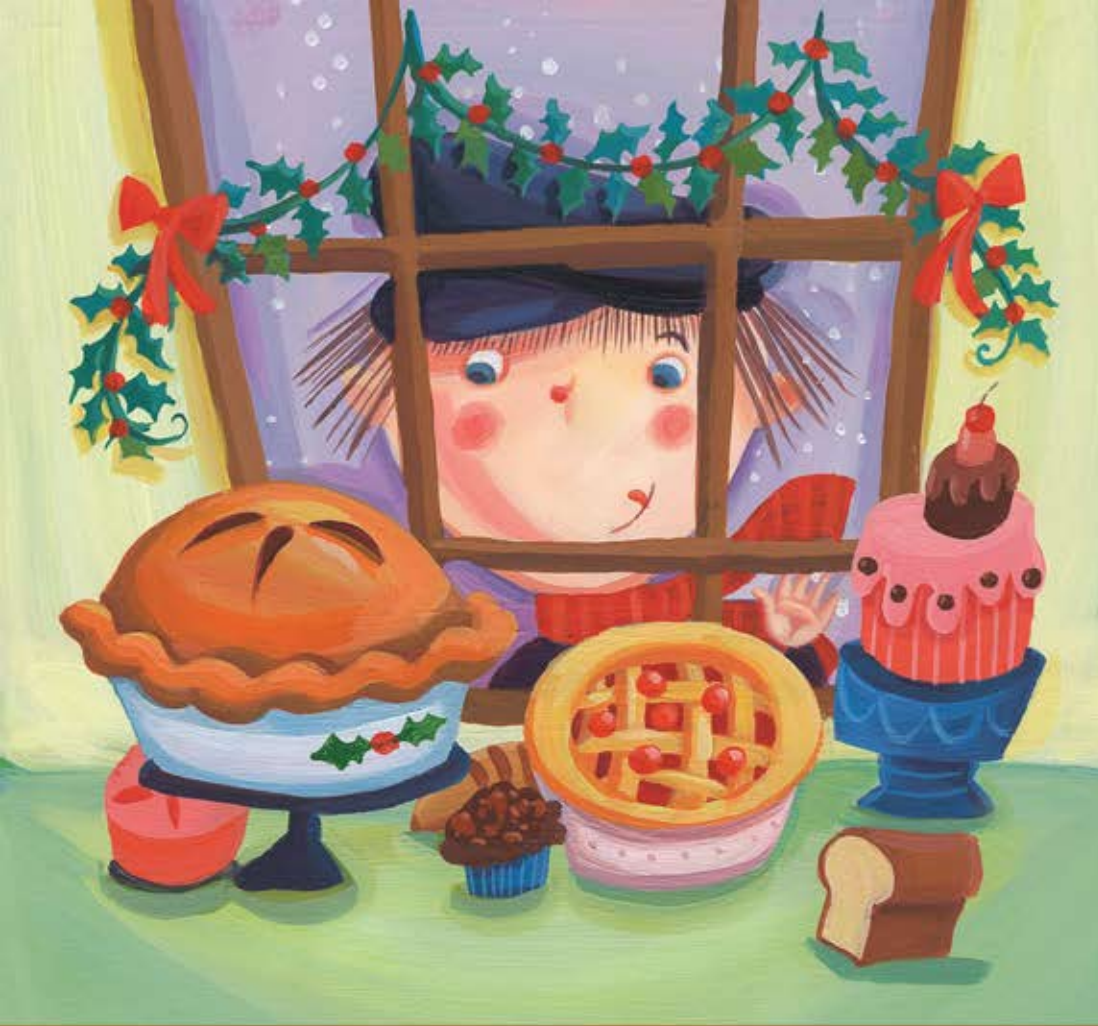
Little Jack Horner