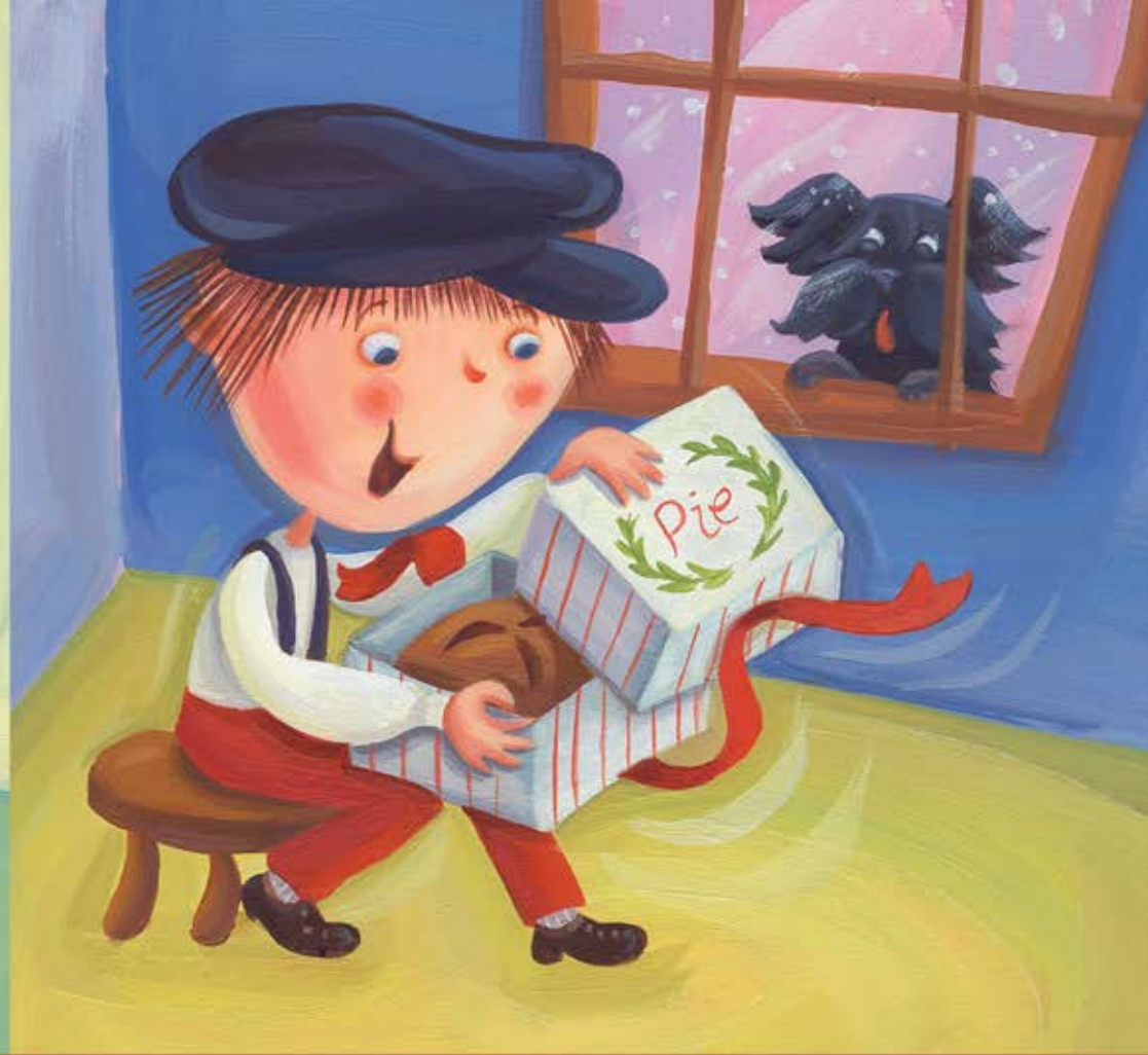
sat in the corner