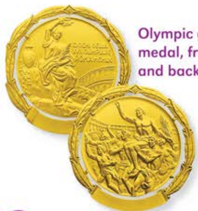
Olympic gold medal, front and back

Clay trained hard. When he was just 17, he won a big championship called the Golden Gloves. The next year, in 1960, Clay was part of the United States Olympic Team. He won every fight and earned a gold medal.