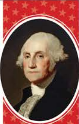
George Washington's Life

1732 George Washington is born on February 22 in Westmoreland County, in the colony of Virginia.