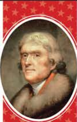
Thomas Jefferson's Life

1743 On April 13, Thomas Jefferson is born in the colony of Virginia.