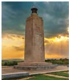
Eternal Light Peace Memorial honored veterans on the 75 th anniversary of the battle