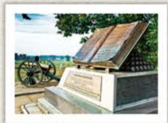
High Water Mark of the Rebellion marks the farthest point reached by the Confederates