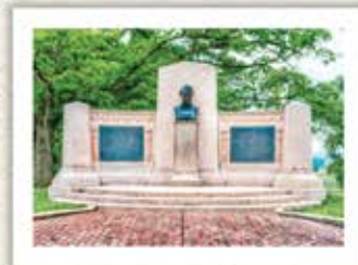
Lincoln's Gettysburg Address Monument honors Lincoln's address, which was given a short distance away from the monument