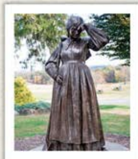
Women's Memorial recognizes the women who helped and suffered during the battle