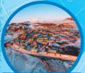
The United States' McMurdo Station