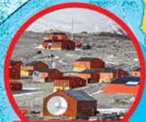
Argentina's Esperanza Base