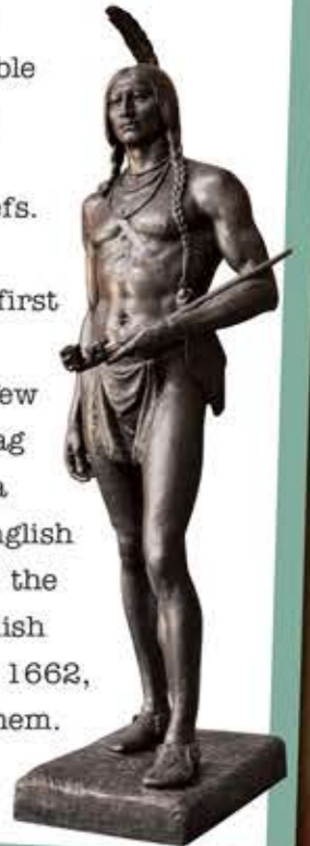
A statue of Massasoit

TENSIONS The Wampanoag and the English settlers had trouble trusting each other. They didn't understand each other's customs and beliefs. A Native American man named Samoset was the first to welcome the English settlers to their land. A few days later, the Wampanoag leader Massasoit signed a peace treaty with the English settlers. For many years, the Wampanoag and the English tried to get along. But in 1662, war broke out between them.