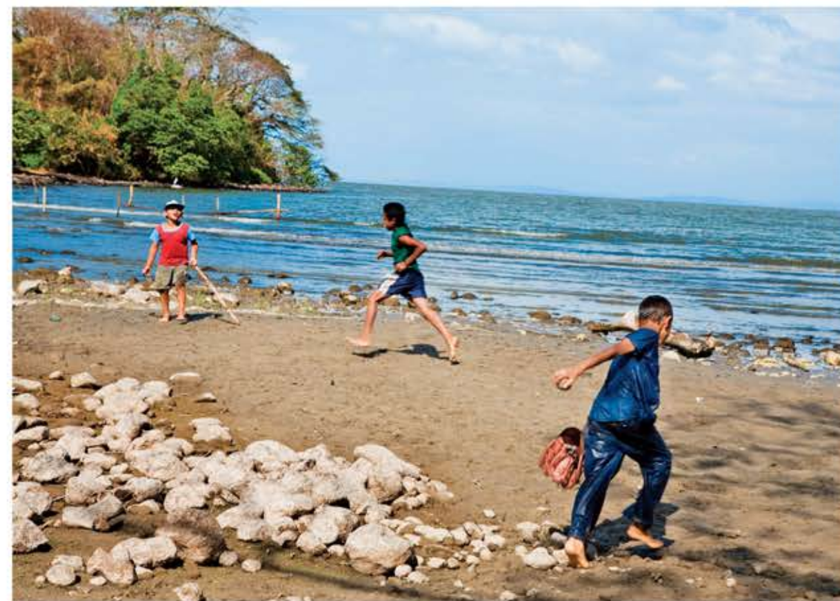
Boys play baseball on the beach by Lake Nicaragua.

Alejandro throws the ball against the house a few more times. It doesn't seem to bother María in the least. She is lost in that book of hers. He has always been impressed by how well she can concentrate. He knows she is trying her best with her schoolwork. And their mother is trying her best to take care of them. And their father works hard at his job. Alejandro has every intention of doing his best as well—at his studies, at his baseball practice, at everything. But will it be enough in a place that has seen such hard times? Will it be enough in Nicaragua, a nation that sometimes seems to be teetering between unmatched success and continued failure?