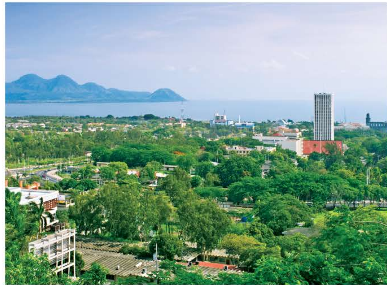
Managua lies on the shores of Lake Managua. The city has been Nicaragua's capital since 1852.